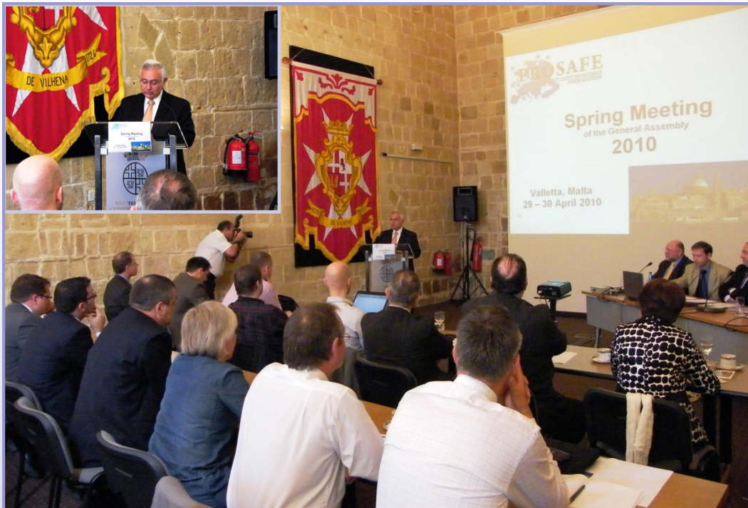
European Commissioner for Health and Consumer Policy, John Dalli addressing the PROSAFE General Assembly held in the Mediterranean Conference Centre (MCC) in Malta on 30th April 2010.

as a video clip of his presentation, including that given by Dr. Chris Said, Maltese Parliamentary Secretary for Consumers, Fair Competition, Local Councils & Public Dialogue can be found by clicking on the respective hyperlinks within the main PROSAFE homepage - www.prosafe.org .