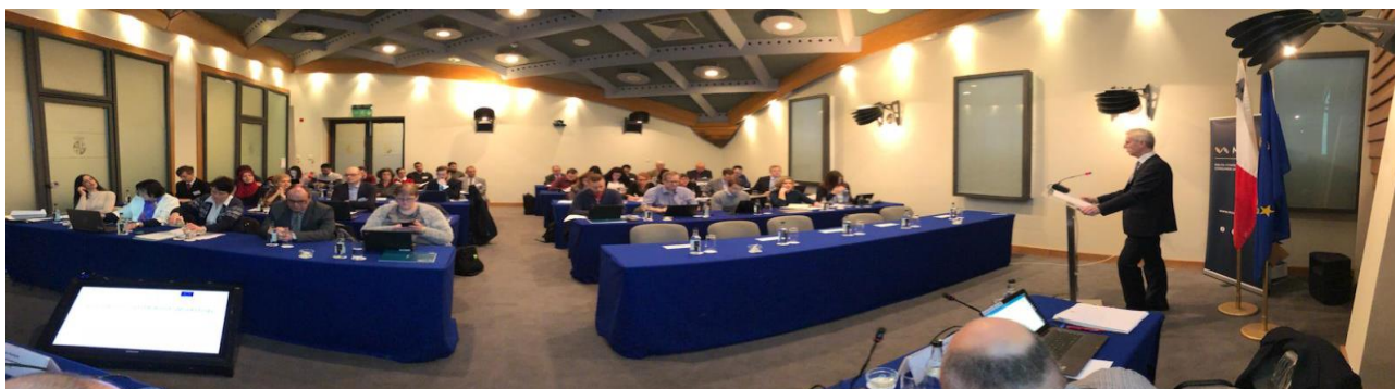
Photo: The JA2016 Annual Market Surveillance Workshop in Malta

To reflect the growing importance of e-commerce, many of the inspected products have been sampled from online shops. The project is coordinated by PROSAFE , a non-profit NGO formed by market surveillance officers and based in Brussels.